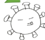
The second feature "fear"